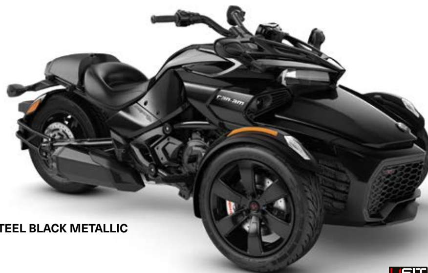
STEEL BLACK METALLIC